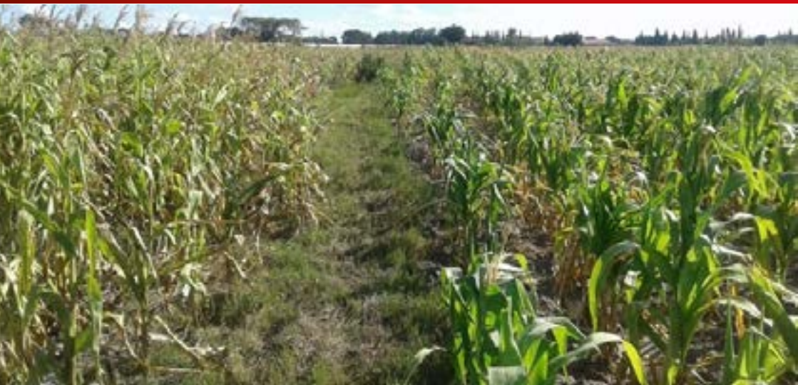
A maize field in Central Zimbabwe